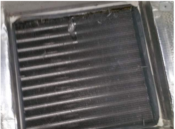
Toilet Exhaust Duct