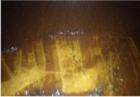
Kitchen Exhaust Duct