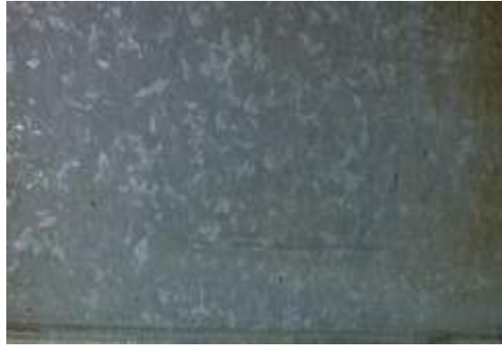
Kitchen Exhaust Hood